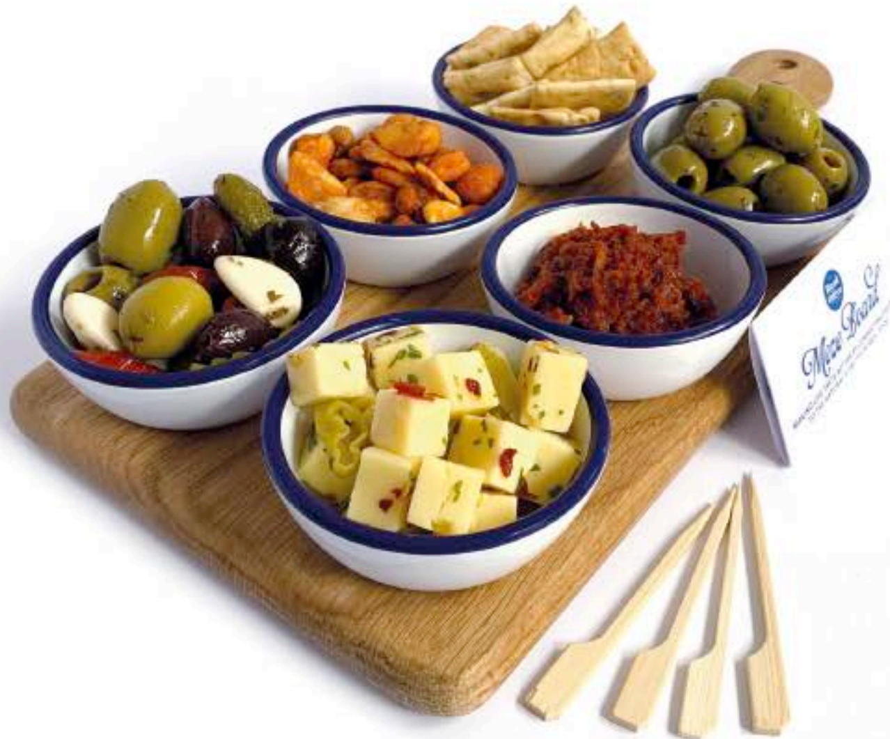
THE REAL OLIVE CO. MEZE BOARD HARDWARE SOLUTION