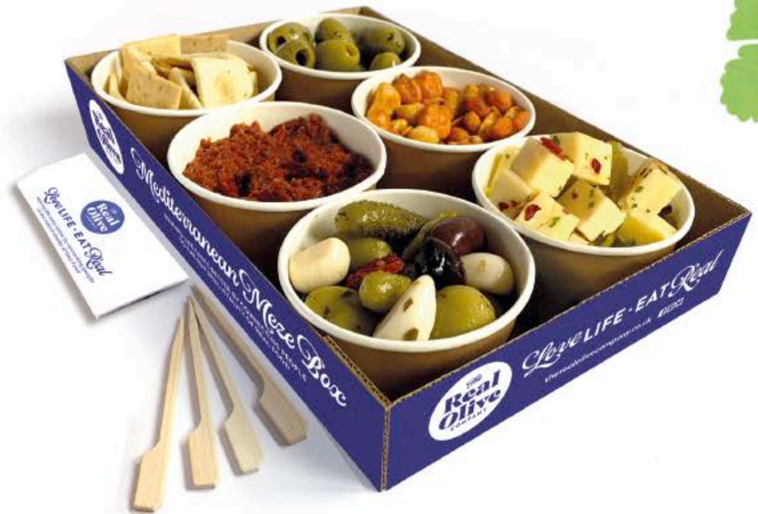
THE REAL OLIVE CO. MEZE BOX RECYCLABLE SOLUTION